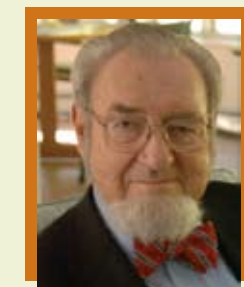
C. Everett Koop, MD, ScD Thirteenth Surgeon General of the United States

Joycelyn Elders, the first person in the state of Arkansas to become board certified in pediatric endocrinology, was the sixteenth Surgeon General of the United States, the first African American and only the second woman to head the U.S. Public Health Service. Long an outspoken advocate of public health, Elders was appointed Surgeon General by President Clinton in 1993. Dr. Elders left office in 1994 and in 1995 she returned to the University of Arkansas as a faculty researcher and professor of pediatric endocrinology at the Arkansas Children's Hospital.