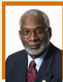
David Satcher, MD, PhD Sixteenth Surgeon General of the United States; Current Director, Center of Excellence on Health Disparities and the Satcher Health Leadership Institute of Morehouse School of Medicine