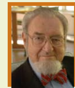
C. Everett Koop, MD, ScD Thirteenth Surgeon General of the United States

Joycelyn Elders, the first person in the state of Arkansas to become board certified in pediatric endocrinology, was the sixteenth Surgeon General of the United States, the first African American and only the second woman to head the U.S. Public Health Service. Long an outspoken advocate of public health, Elders was appointed Surgeon General by President Clinton in 1993. Dr. Elders left office in 1994 and in 1995 she returned to the University of Arkansas as a faculty researcher and professor of pediatric endocrinology at the Arkansas Children's Hospital.